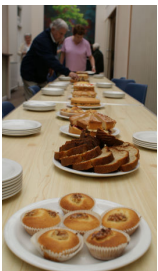
The Upstream Spring Event

NICE Shared Learning Award Public Health Winner 2008