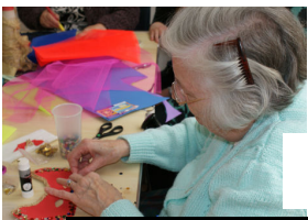
Arts and Crafts activities