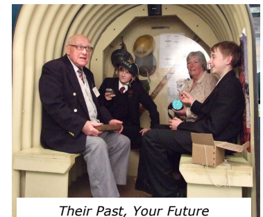
Their Past, Your Future Tiverton Museum